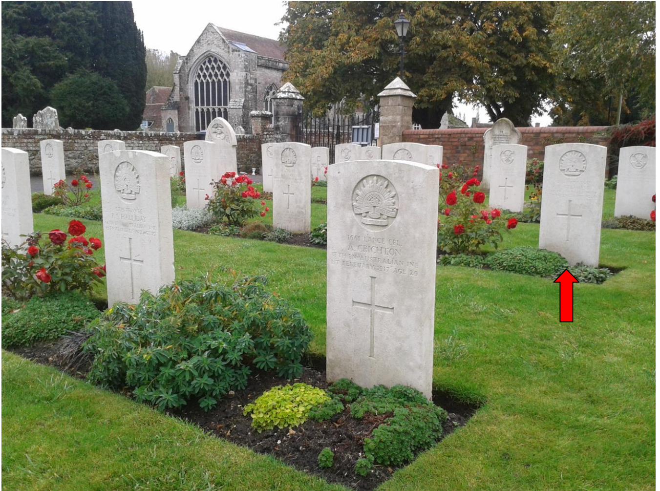
Private C. R. Stephens' headstone marked by red arrow