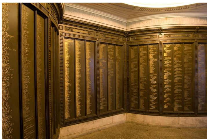
National War Memorial – Adelaide